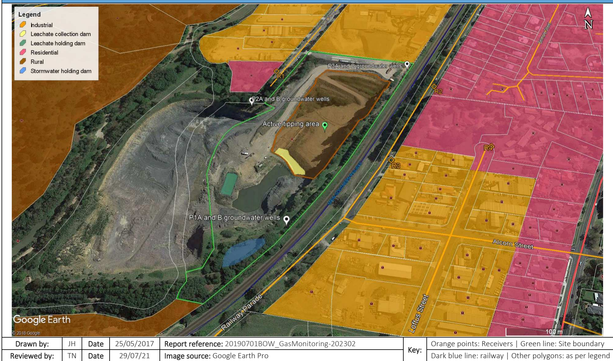
Figure 1: Simulated oblique image showing Site layout, key features and nearby sensitive receivers.