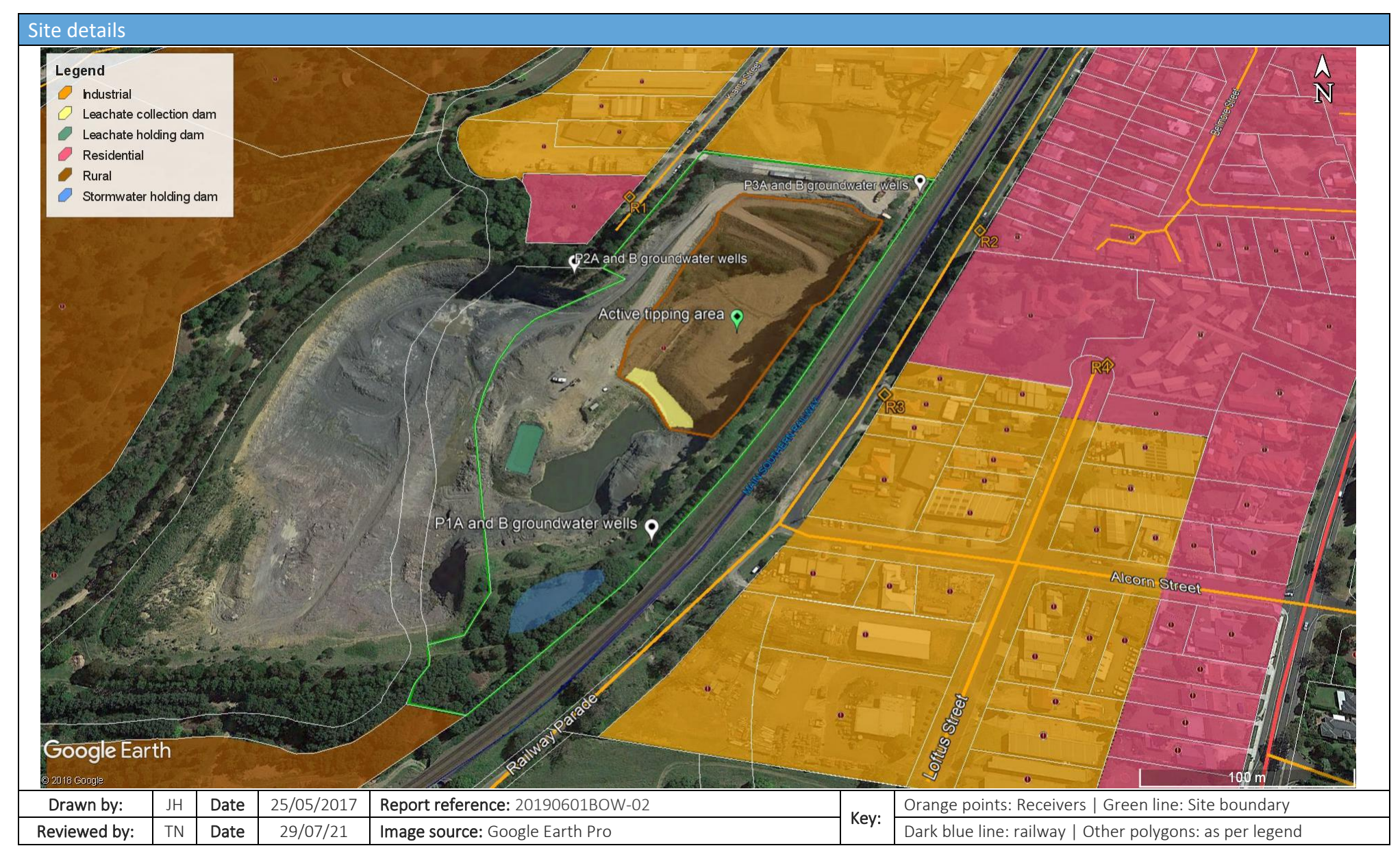
Figure 1: Simulated oblique image showing Site layout, key features and nearby sensitive receivers.